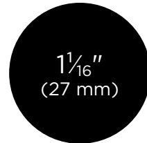
Mersen Class J Sizes