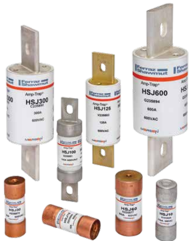
Fuses are 100% tested before leaving the factory to ensure they will perform as intended.

A fuse does not have a “mean time between failures” because theoretically a fuse only needs to be replaced once it opens on an overcurrent. Fuses are 100% tested before leaving the factory to ensure that they will perform as intended. In the real world, factors such as temperature and humidity can cause a fuse to need replacement. Mersen suggests using ten years as a guideline for replacing both fuses installed and in inventory.