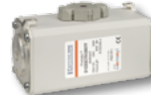
SEMICONDUCTOR PROTECTION FUSES