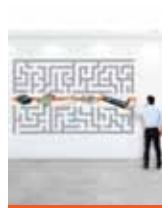
DESIGN • SIMULATIONS • TESTING •