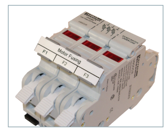
Continuous marking strip and adaptors