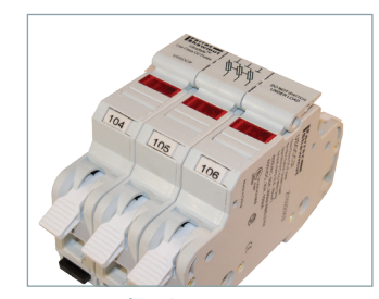
WMB Marker System